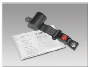
◀ 31579KS Handrail Restraint Retractable - for 51" Platforms