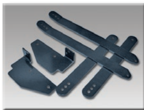
◀ 35295KKS Upper Tower Support Kit