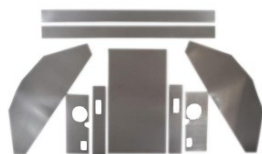
◀ 402606KS Padding Kit