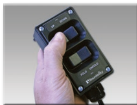
◀ 33659KS Replacement Hand-Held Control Assembly Pendant